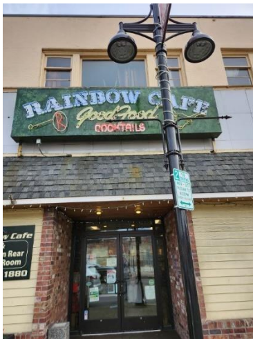
112 E. Main St. Auburn, WA. 98002 Rear entrance to Rainbow Cafe (253) 833-1880